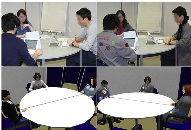
Fig. 2. Participants in the Control (top left), Face-to-face + SIC (top right), Virtual (bottom left) and Virtual + SIC (bottom right) condition.

In line with Hypotheses 1 and 2, we studied the performance of brainstorming groups in 2 (SIC: without vs. with) x 2 (Setting: face-to-face vs. virtual) brainstorming conditions (between-subject variables): in the face-to-face setting without SIC (Control condition, see Fig. 2 top left panel), in the face-to-face setting wearing their coat (Real + SIC condition, see Fig. 2 top right panel), in a virtual environment using avatars with neutral clothes (Virtual condition, see Fig. 2 bottom left panel) or in a virtual environment using avatars wearing coats (Virtual + SIC condition, see Fig. 2 bottom right panel). The groups were randomly assigned to the